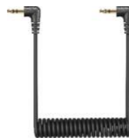
GAC-IC3 3.5mm TRS to TRS Audio Cable