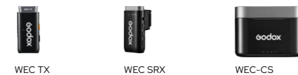
WEC TX WEC SRX WEC-CS