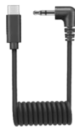
GAC-IC9 USB-C to 3.5mm TRS Audio Cable