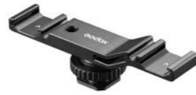
VSM-H03 Dual Cold Shoe Extension