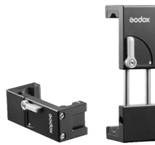
MTH03 Metal Smartphone Clip