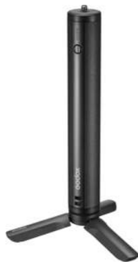
BPC-01 10000mAh Charging Grip