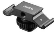
VSM-H02 Dual Cold Shoe Extension