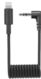
GAC-IC10 Lightning to 3.5mm TRS Audio Cable