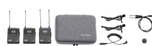
WMicS1 Kit 2