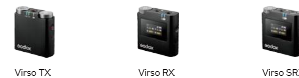
Virso TX Virso RX Virso SRX