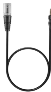
GAC-IC1 XLR to 3.5mm Audio Cable