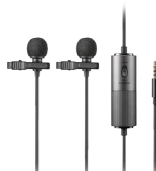
LMD-40C Dual Omnidirectional Lavalier Microphone