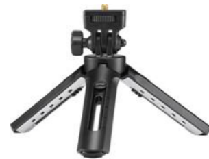
MT01 Mini Tripod