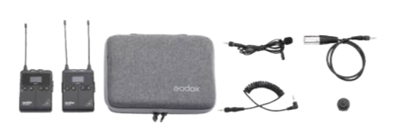
WMicS1 Kit 1