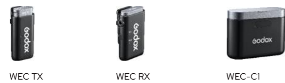
WEC TX WEC RX WEC-C1