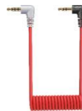
GAC-IC4 3.5mm TRS-TRRS Cable