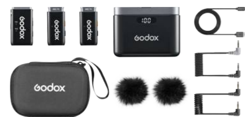
WEC Kit2 (With TRRS or USB-C Adapter)