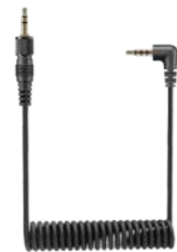
GAC-IC2 3.5mm TRS to TRRS Audio Cable