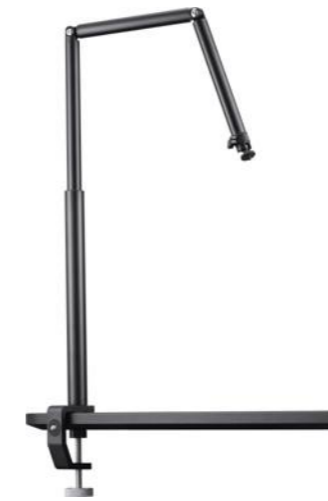
VSM-B01 Desk-mounted Boom Arm