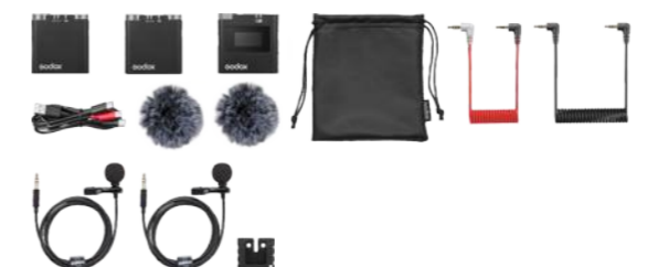
Virso S M2