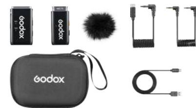
WEC Kit1 (With TRRS or USB-C Adapter)