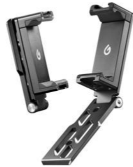
MTH04 Metal Collapsible Bracket