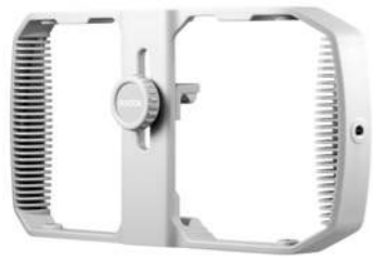
VSS-R01 Smartphone Rig