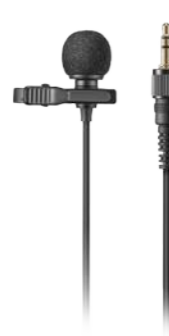
LMS-12A AXL Lavalier Microphone