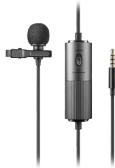
LMS-60C Omnidirectional Lavalier Microphone