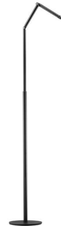
VSM-R03 Round Base Adjustable Stand