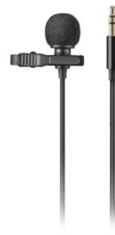
LMS-12A AX Lavalier Microphone