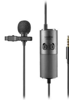
LMS-60G Omnidirectional Lavalier Microphone with Adjustable Gain