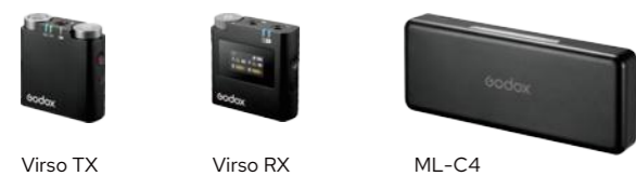
Virso TX Virso RX ML-C4