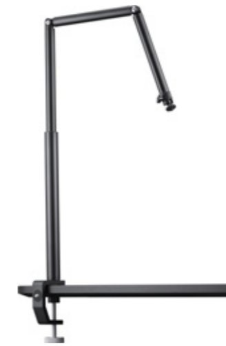
VSM-B01 Desk-mounted Boom Arm