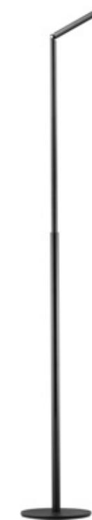
VSM-R02 Round Base Adjustable Stand