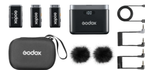
WEC Kit2 (With TRRS or USB-C Adapter)