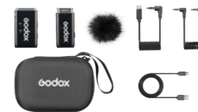
WEC Kit1 (With TRRS or USB-C Adapter)