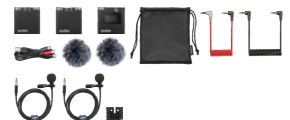
Virso S M2