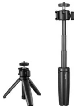
MT03 Extensible & Rotatable Tripod