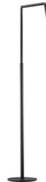
VSM-R01 Round Base Adjustable Stand