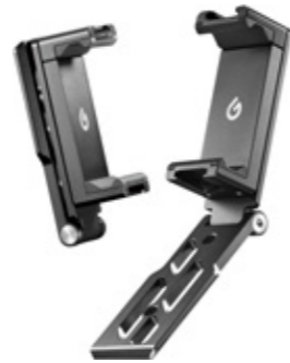
MTH04 Metal Collapsible Bracket