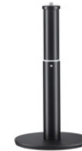
VSM-D01 Desktop Stand