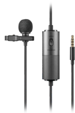
LMS-60C Omnidirectional Lavalier Microphone