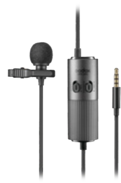
LMS-60G Omnidirectional Lavalier Microphone with Adjustable Gain