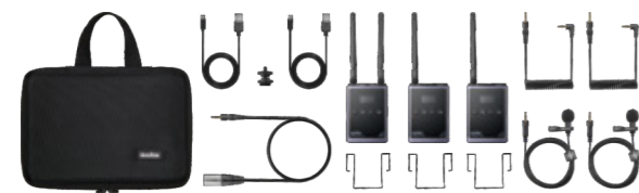
WMicS1 Pro Kit 2