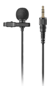
LMS-12A AXL Lavalier Microphone