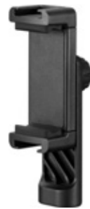
MTH02 Phone Clamp