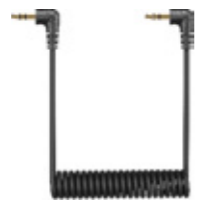
GAC-IC3 3.5mm TRS to TRS Audio Cable