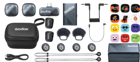
Cube-C Combo Kit2