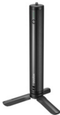
BPC-01 10000mAh Charging Grip