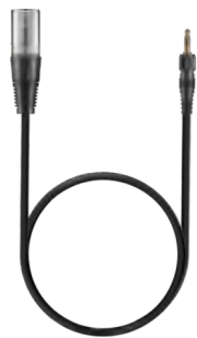
GAC-IC1 XLR to 3.5mm Audio Cable