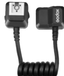
GAC-IC13 Multi-Interface Shoe Extension Cable