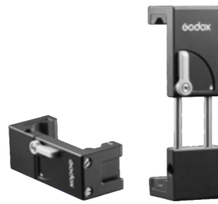
MTH03 Metal Smartphone Clip