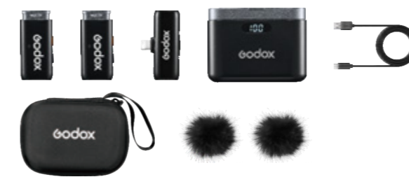
WES Kit2 (Optional LT/UC version)