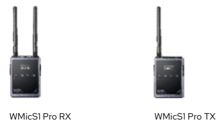
WMicS1 Pro RX WMicS1 Pro TX