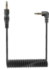
GAC-IC2 3.5mm TRS to TRRS Audio Cable