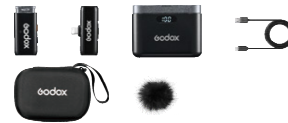
WES Kit1 (Optional LT/UC version)