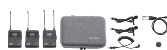
WMicS1 Kit 2