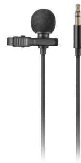
LMS-12A AX Lavalier Microphone