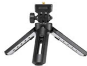
MT01 Mini Tripod