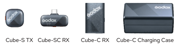
Cube-S TX Cube-SC RX Cube-C RX Cube-C Charging Case