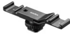
VSM-H03 Dual Cold Shoe Extension