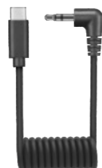
GAC-IC9 USB-C to 3.5mm TRS Audio Cable