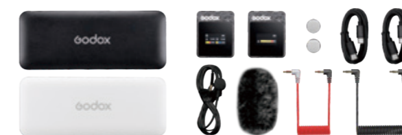
ML II-C3 MoveLink II M1