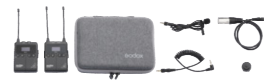
WMicS1 Kit 1