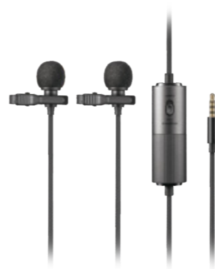
LMD-40C Dual Omnidirectional Lavalier Microphone