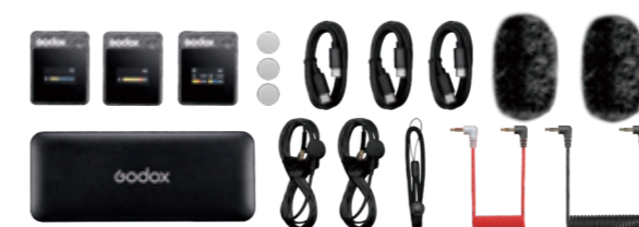
MoveLink II M2