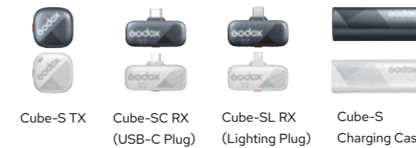
Cube-S TX Cube-SC RX (USB-C Plug) Cube-SL RX (Lighting Plug) Cube-S Charging Case