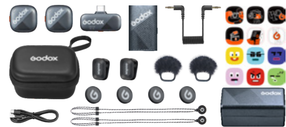
Cube-C Combo Kit1