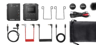
WMicS2 Kit 1