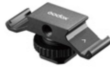
VSM-H02 Dual Cold Shoe Extension