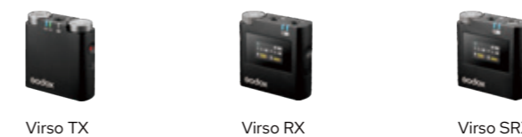
Virso TX Virso RX Virso SRX