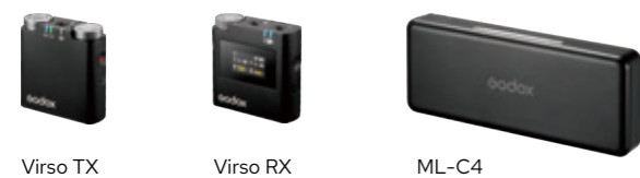
Virso TX Virso RX ML-C4