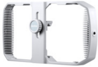
VSS-R01 Smartphone Rig