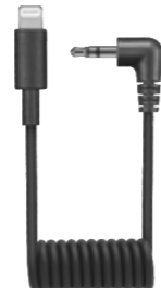
GAC-IC10 Lightning to 3.5mm TRS Audio Cable