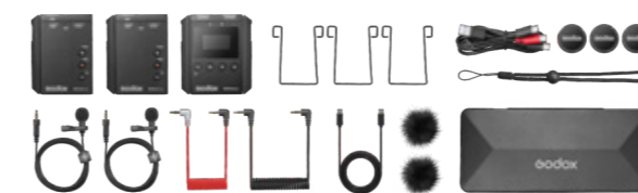
WMicS2 Kit 2