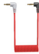
GAC-IC4 3.5mm TRS-TRRS Cable