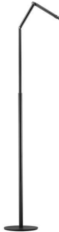
VSM-R03 Round Base Adjustable Stand