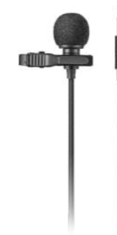
LMS-12A AX Lavalier Microphone