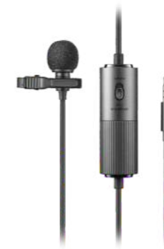
LMS-60C Omnidirectional Lavalier Microphone