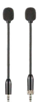
LMS-1N/LMS-1N Gooseneck Microphone