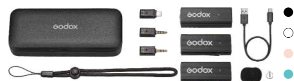
MoveLink Mini UC Kit2/LT Kit2