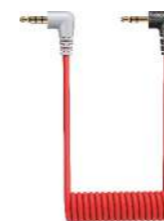
GAC-IC4 3.5mm TRS-TRRS Cable