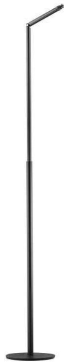
VSM-R02 Round Base Adjustable Stand