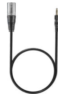
GAC-IC1 XLR to 3.5mm Audio Cable