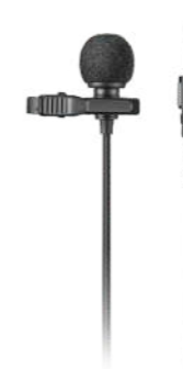
LMS-12A AXL Lavalier Microphone