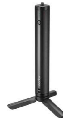
BPC-01 10000mAh Charging Grip