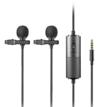
LMD-40C Dual Omnidirectional Lavalier Microphone