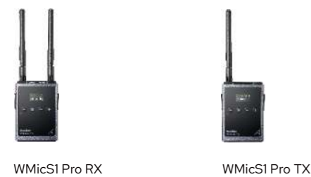
WMicS1 Pro RX WMicS1 Pro TX