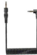
GAC-IC2 3.5mm TRS to TRRS Audio Cable