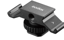
VSM-H02 Dual Cold Shoe Extension