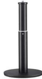
VSM-D01 Desktop Stand