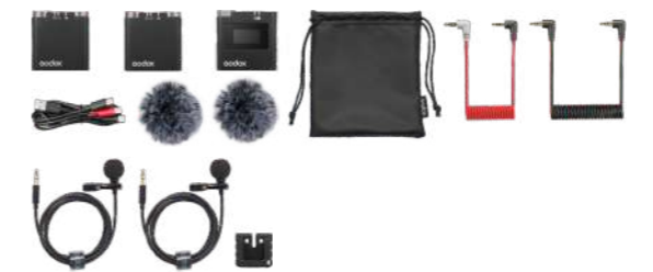
Virso S M2