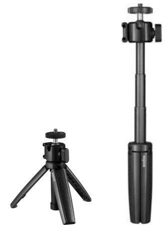
MT03 Extensible & Rotatable Tripod