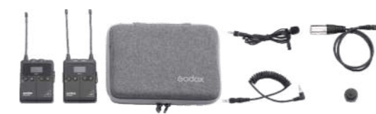
WMicS1 Kit 1