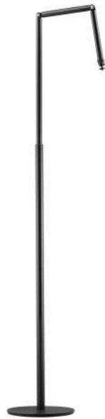
VSM-R01 Round Base Adjustable Stand