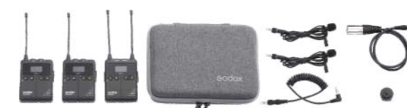
WMicS1 Kit 2