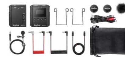
WMicS2 Kit 1