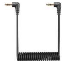
GAC-IC3 3.5mm TRS to TRRS Audio Cable