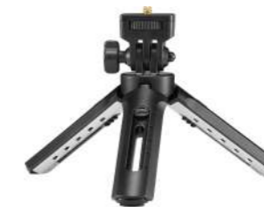
MT01 Mini Tripod