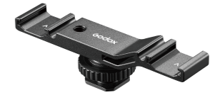
VSM-H03 Dual Cold Shoe Extension