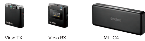
Virso TX Virso RX ML-C4