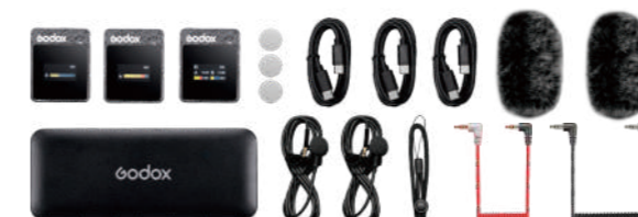
MoveLink II M2