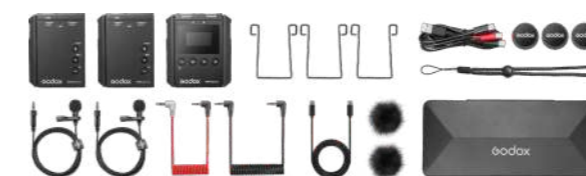
WMicS2 Kit 2