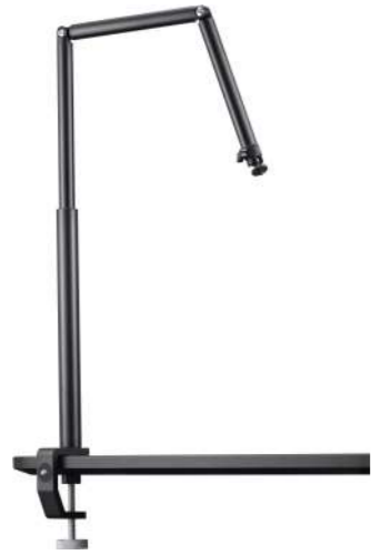
VSM-B01 Desk-mounted Boom Arm