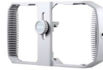
VSS-R01 Smartphone Rig