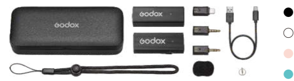
MoveLink Mini UC Kit1/LT Kit1