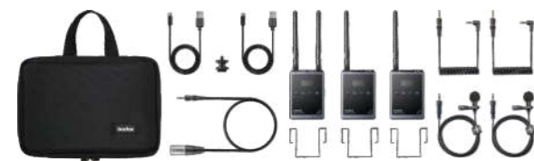
WMicS1 Pro Kit 2