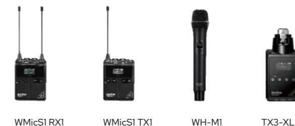
WMicS1 RX1 WMicS1 TX1 WH-M1 TX3-XLR