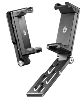
MTH04 Metal Collapsible Bracket