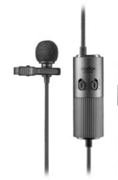
LMS-60G Omnidirectional Lavalier Microphone with Adjustable Gain