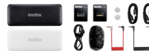
ML II-C3 MoveLink II M1