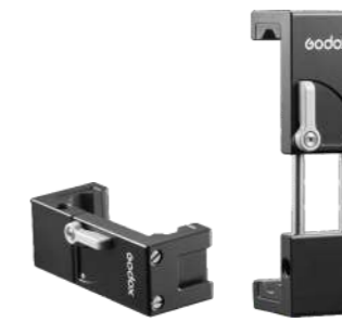
MTH03 Metal Smartphone Clip